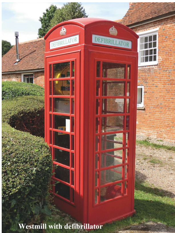
Westmill with defibrillator

The colour red was chosen to make them easy to spot, although Scott had suggested silver. These robust and iconic survivors of the 20th century, found in almost every town and village, are worth preserving. At the last count, 51 within the Hundred Parishes had been listed.