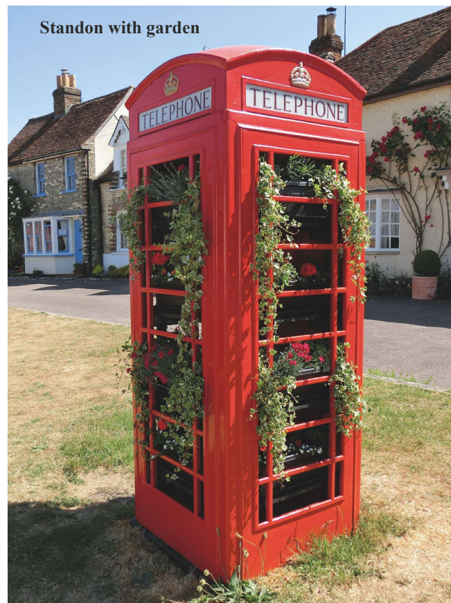
Standon with garden

Some villages have been even more imaginative: the box in Standon has been transformed into a greenhouse full of colourful plants.